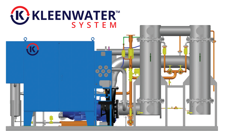
Ceramic Microfiltration (CMF)

Kemco has a patented process for treating high-strength industrial wastewater. This innovation takes advantage of the robust ceramic microfiltration to remove Total Suspended Solids (TSS) and Oils and Greases (O&G). This first step, in combination with Kemco's specially designed high temperature reverse osmosis system, can produce treated water that is of the highest standard, allowing for water reuse. Reverse osmosis can then remove Total Dissolved Solids (TDS) such as salts, organics, detergents and other contaminants. This combination achieves low TDS, low Biochemical Oxygen Demand (BOD) and produces exceptional water which can be reused back in to industrial process.